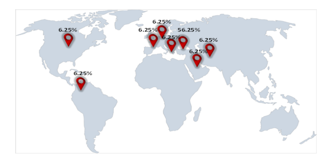
Figure 2. Geographical distribution of the studies on hydatid cysts inside the pulmonary artery.